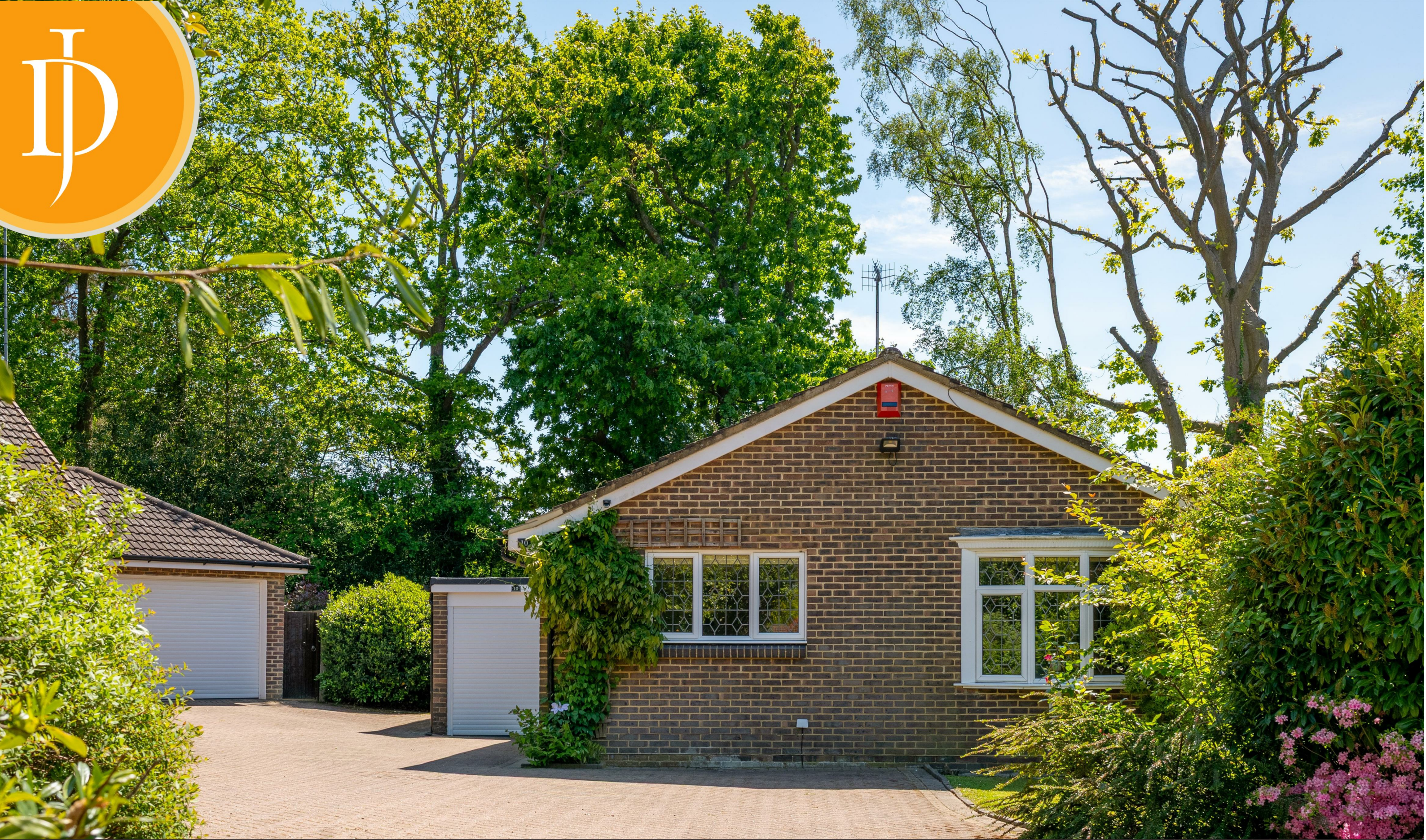
10 Spring Gardens, Copthorne, Crawley, RH10 3RS Guide Price £525,000 - £550,000